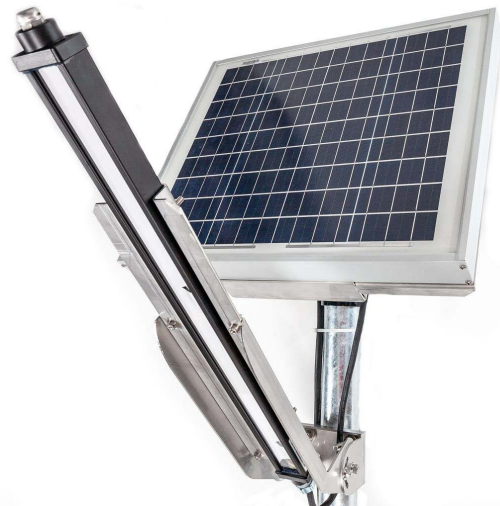
*GS Yoke Mount attached